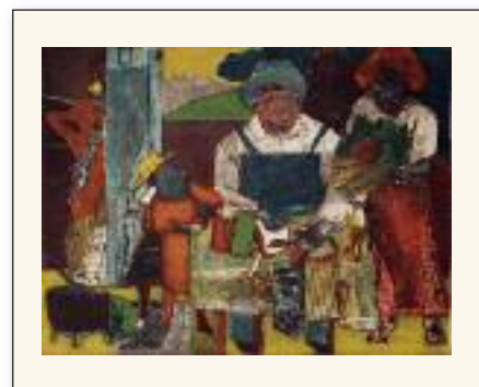
Romare Bearden The Family, 1975 Etching