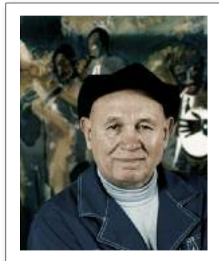
Romare Bearden, 1980