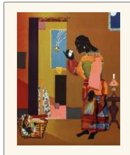
Romare Bearden Falling Star , 1979 Lithograph

The national museum tour, organized by Landau Traveling Exhibitions, Los Angeles, CA, will travel to museums throughout the country through 2012.