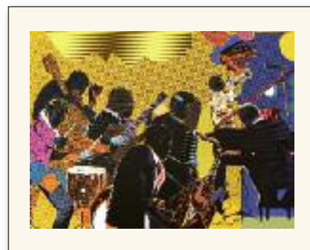
Romare Bearden Out Chorus , 1979-80 Etching, aquatint & serigraph