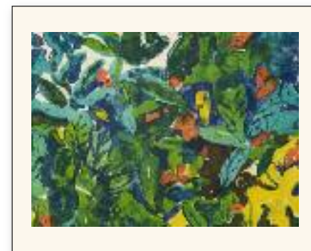
Romare Bearden Tropical Flowers , 1971-72 Etching